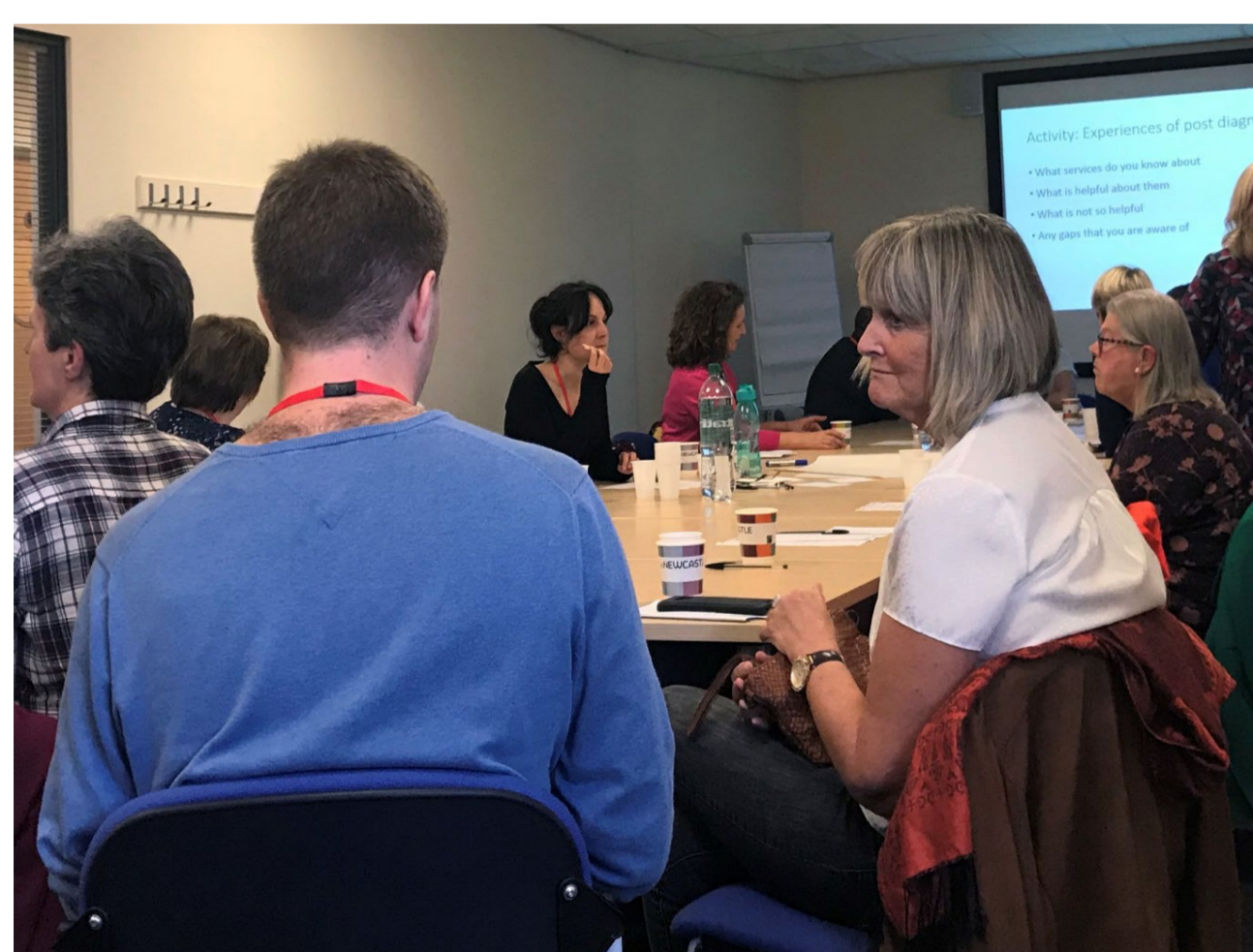
Initial meeting of the DCC

The importance of actively involving patients and public in research is now well-established. Commonly this takes the form of a patient and public involvement (PPI) panel or advisory group. The DCC represents an innovative approach to involvement by engaging a wider range of stakeholders in the same group, including those who use dementia services and those involved in their delivery, to inform and shape the work of PriDem.